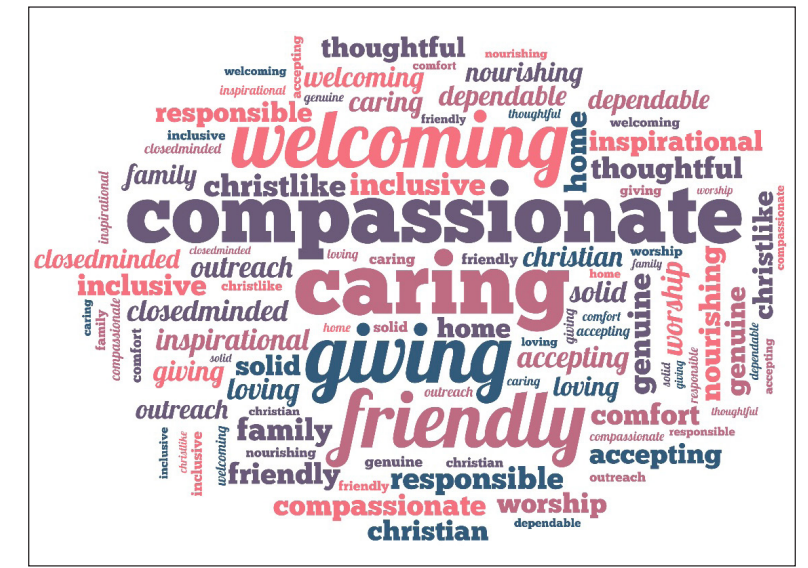
Figure 3: Words used to describe FBC